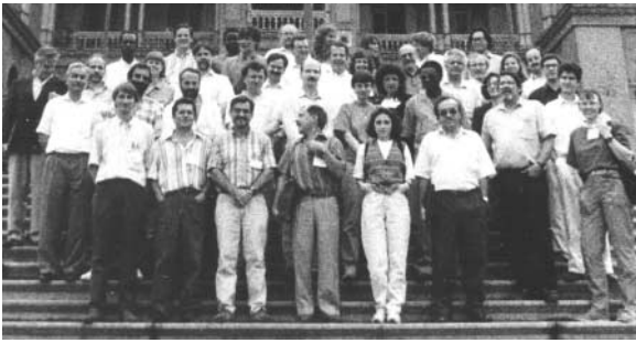
Fig. 2. Group photograph of the participants of the FIOCRUZ-TDR Parasite Genome Network Planning Meeting, held in Rio de Janeiro, Brazil, on 14 and 15 April 1994. This international meeting, attended by 40 scientists and 5 representatives from WHO, selected the three parasite strains whose genome sequences are published in this issue of Science by the Tritryp project.

investigators (34). The India–Brazil–South Africa Dialogue Forum, established in June 2003, includes a focus on intellectual property and access to medicine, traditional medicine, and R&D on vaccines and pharmaceutical products to address national health priorities. The Technological Network on HIV/AIDS, which was announced in Bangkok during the July 2004 International AIDS Conference, includes Brazil, China, Cuba, Nigeria, Russia, Thailand, and Ukraine (with perhaps India and South Africa joining in the near future). The Network supports research and South-South technology transfer to develop and manufacture antiretroviral drugs and new drug formulations, male and female condoms, microbicides, and HIV vaccines. Finally, the WHO Developing Countries' Vaccine Regulators Network, created in September 2004, involves Brazil, China, Cuba, India, Indonesia, Russia, South Africa, South Korea, and Thailand.